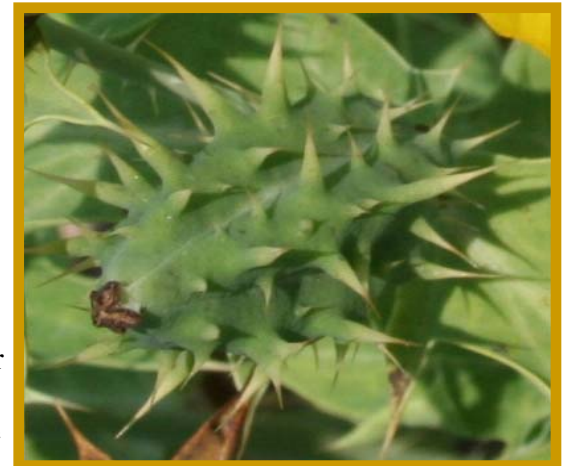
Seed capsules of Mexican prickly poppy are approximately 1.5 inches long with numerous spiny prickles.

Although this weed is common throughout all Florida, it is typically not a wide-spread problem weed. But for those who wish to control it, 2,4-D or WeedMaster (or other products containing 2,4-D + dicamba) are the most effective and economical herbicides for control. The application rate for each herbicide is 3 pt/acre for broadcast applications. If spot spraying is necessary, a 3% solution of either 2,4-D or 2,4-D + dicamba in water is appropriate. Remember, it is best to treat a younger plant, especially before seed set occurs to ensure that seeds are not added to the soil seedbank.