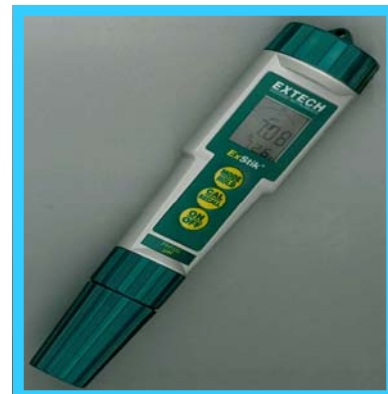
Fig.2. pH meter