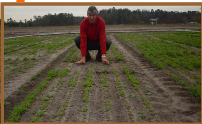
Clovers with sting nematode infestation—associated with warm winter in FL.