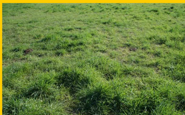
Stunted rye planting in north-central Florida.