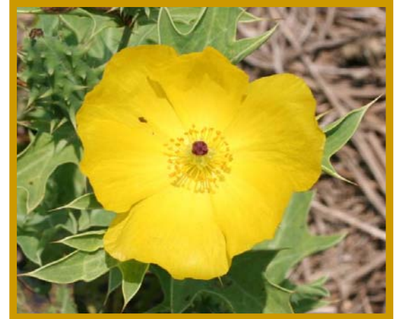
Flowers of Mexican prickly poppy are approximately 2.5 inches in diameter and have 4 to 6 yellow petals

Seed: Seeds are produced inside a prickly capsule measuring at 1.5 inches in length. Approximately 3 to 6 openings in the capsule allow the seeds to disperse, but many of the seeds can remain inside the capsule for weeks until wind or animals shake the plant. Up to 400 seeds can be enclosed by a single capsule and the seeds may stay dormant in the soil for many years.