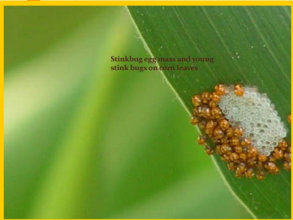
Corn leaf and stinkbug eggs.

If corn is planted into cover crops, cover crops should be killed at least 2-3 weeks before planting or an in-furrow insecticide should be used for control of southern corn root worm, cutworms, etc. These insects will stay in the soil for a couple of weeks as the cover crop is dying and then will go to the newly emerged corn for feeding as soon as it has germinated. Early planted corn has a better chance of avoiding leaf and whorl feeding fall armyworm as well as damaging disease epidemics during its growth period. Planting in early March often results in high yield and quality. Corn is not very susceptible to frost since the growing point remains under the soil surface until corn reaches about 12" high. The vegetative stage of growth can be slow from early planting but still fares better in most years than when corn is planted in late March and April. Stink bug should be controlled when corn starts to silk and tassel because they will cause considerable damage and may result in high levels of aflatoxin making it unsuitable for sale for livestock feed or in ethanol production. The problem is that the aflatoxin would stay with the dried distillers